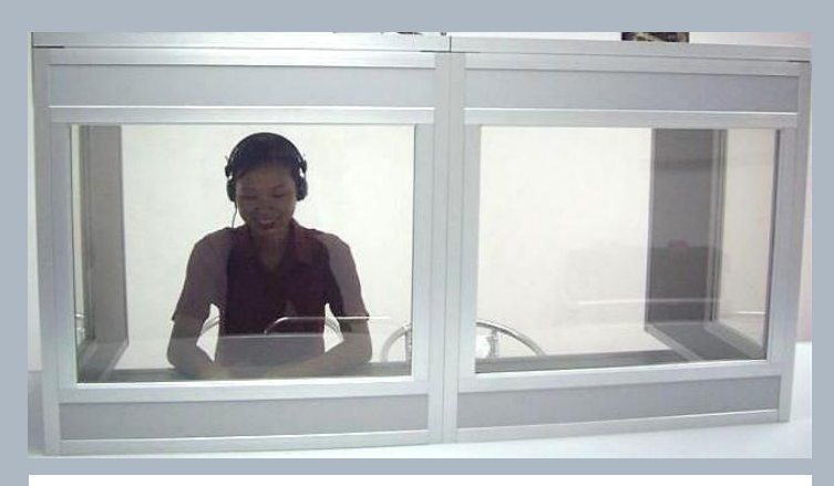
$150/day or $450/week

The exterior is grey laminate and the interior layered in acoustic foam laminated with perforated imitation leather give the booth a professional and upscale appearance, while its generous dimensions make it a true 2-interpreter tabletop booth.