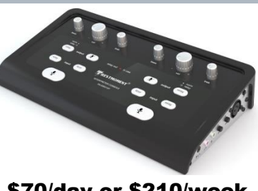
$70/day or $210/week