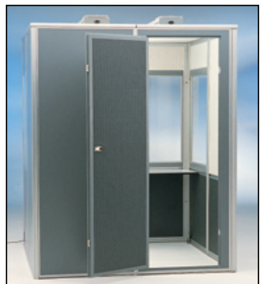
Silent 9300 with vent A

The Silent 9300 up to 3200 mm for 4 persons