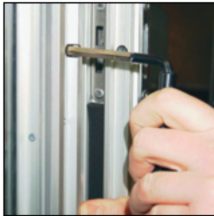
Locks with Hexkey