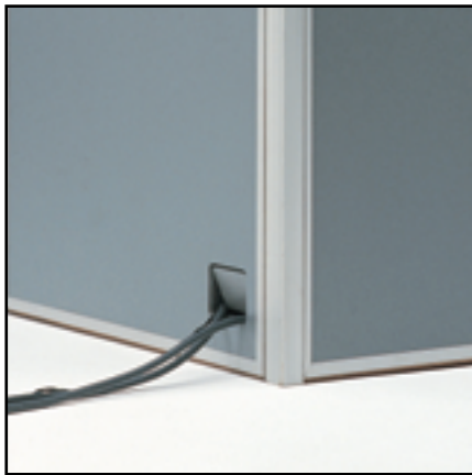
Silent 9300/9500 cable input

Cable in- and outlets are situated in the sidewalls (Silent 9300 and 9500) of the cabin and in the working table. The Silent 6300 has cable-outlets in a floor element. The working table in the Silent 6300 has an extra shelf underneath for optimal use of the table surface. (Optional for Silent 9300 and 9500)